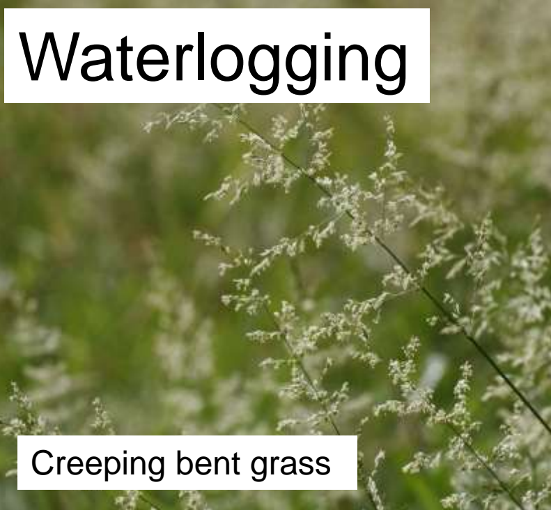
Creeping bent grass