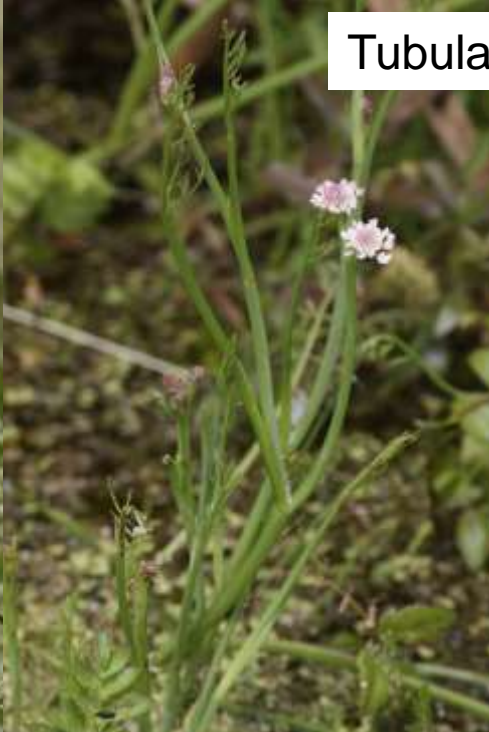
Tubular water dropwort