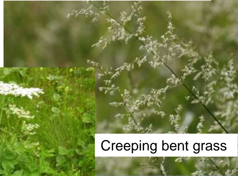
Creeping bent grass