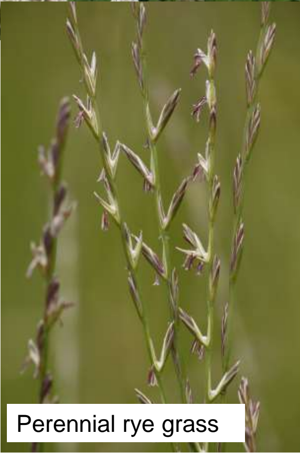
Perennial rye grass