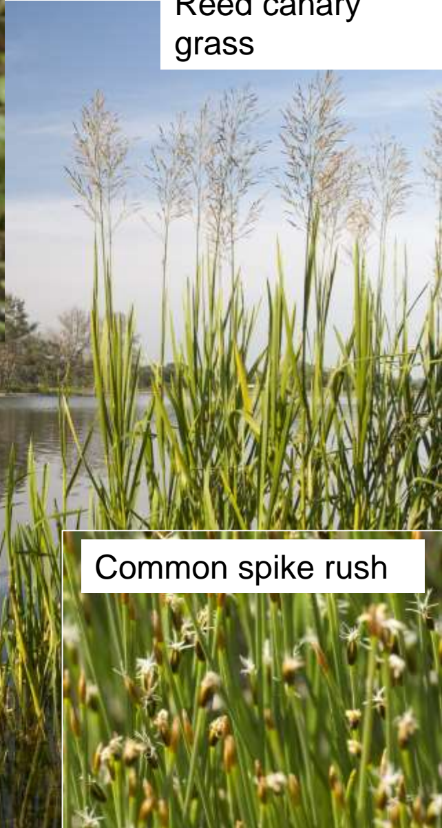
Reed canary grass