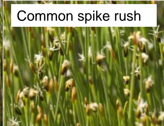
Common spike rush